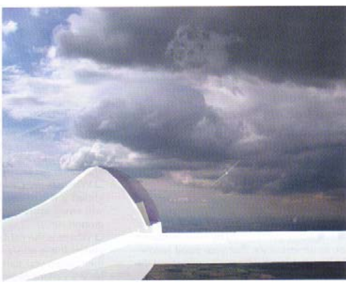
Note the position of the thermalling glider's tail against a point on the horizon; this should be the extent of its turn

FOR SOME years now, soaring pilots have found it beneficial to fly in pairs, and the recent results of our gliding teams have proved this to be a highly effective tactic. There are several reasons for this, one of which is the fact that two gliders flying in a co-operative manner will almost always centre a thermal faster and subsequently outclimb an individual.