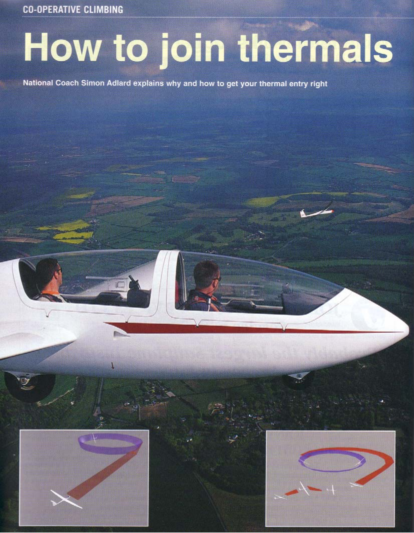
Sailplane & Gliding